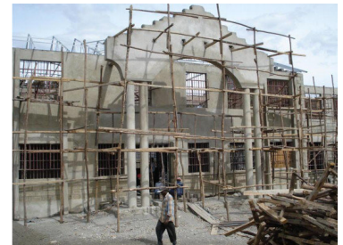
The latest photo of the front of the new addition