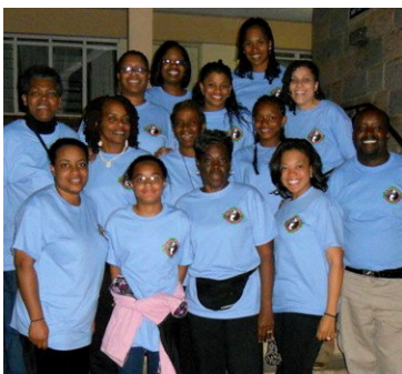
Team from Total Grace Church

of the team provided medical consultations to over 150 individuals from the community. Another Boaz Project team is being planned for the fall of 2011.