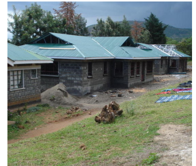
The two new children's homes under construction

The Kenya Project wishes to thank the many families who have helped provide funding for these two homes and for those of you who have supported our many fundraising efforts. Orphan sponsorships are $100 per month, covering living expenses and tuition.