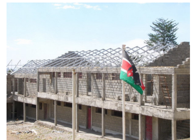
Twenty new classrooms under construction